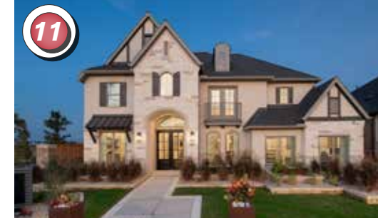
11 Perry Homes 65' Sycamore Point From the $660's 5603 Logan Ridge Ln. (281) 633-8500 Lamar CISD