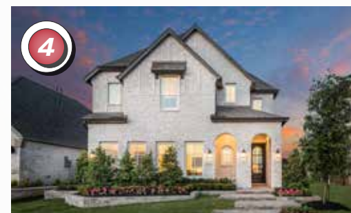
4 Highland 40' Legacy Ridge Now Pre-Selling From the $380's (936) 203-8563 Lamar CISD