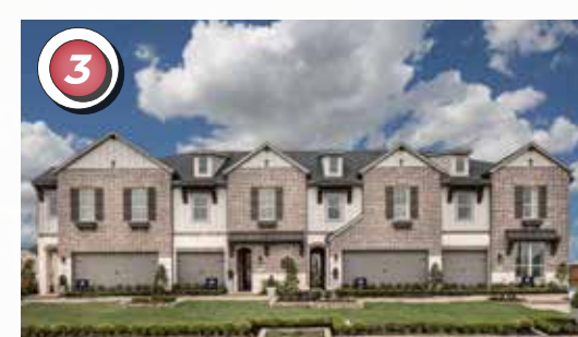
3 Highland Townhomes From the $380's 6543 Bramble Cove Lane (713) 493-9200 Katy ISD