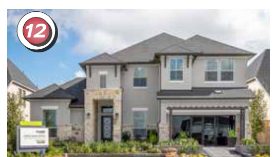
12 Tri Pointe Homes 65' Sycamore Point From the $620's 5607 Logan Ridge Ln. (281) 675-3736 Lamar CISD