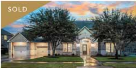
6211 FLEWELLEN FALLS LN | FULSHEAR, TX