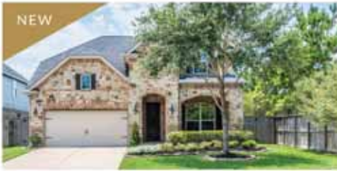
5302 LITTLE CREEK COURT | FULSHEAR, TX