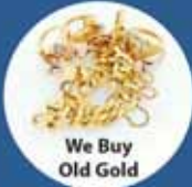
We Buy Old Gold

Ideal Diamond Buyers • 8045 FM 359 Rd S. • Fulshear