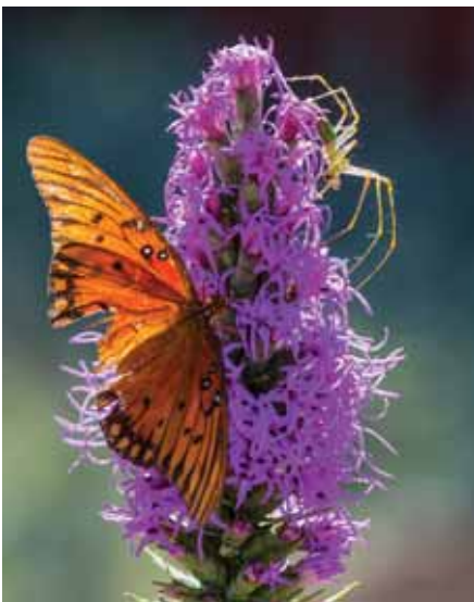
Native plants like this liatris bloom support insect communities, which in turn are the perfect food for bird populations.

We're excited to introduce an article that will become a permanent fixture in our newsletter, keeping you informed and engaged. This dynamic piece of content will undergo regular updates every quarter, ensuring it stays fresh and relevant. You can trust that you'll always have access to up-to-date and valuable knowledge. Join us as we embark on this exciting journey of perpetual growth and discovery!