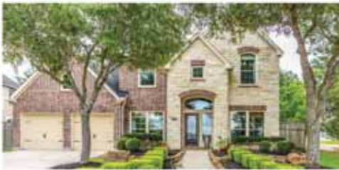
6327 W LAKESHORE LAGOON DR | FULSHEAR, TX