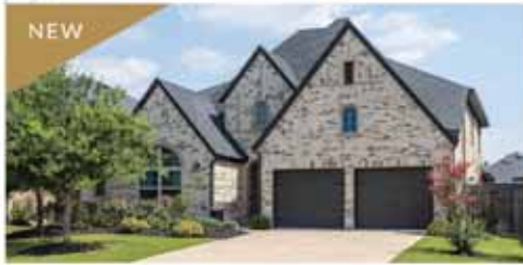
27938 CASTLE PARK LN | FULSHEAR, TX