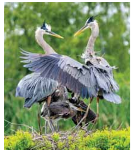
The CCR neighborhood heron family. The mother (right) has just flown in to join the father.

Summer is also the season of roaming reptiles. Our aquatic turtles are often seen crossing roads and digging nests in flowerbeds. A helping hand across a road in the direction of their travel can sometimes make the difference between life and death for them. In contrast, a roaming snake is usually a less-welcome