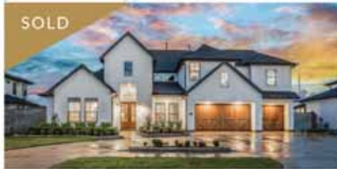
27919 INDIGO RIDGE DR | FULSHEAR, TX