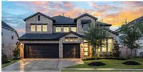
4207 ANA RIDGE LN | FULSHEAR, TX