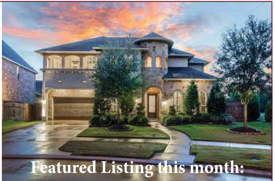
Featured Listing this month: 6102 Pepper Trail Lane

We utilize the latest technologies, market research and business strategies to exceed your expectations. More importantly, we listen and that means we find solutions that are tailored to you.